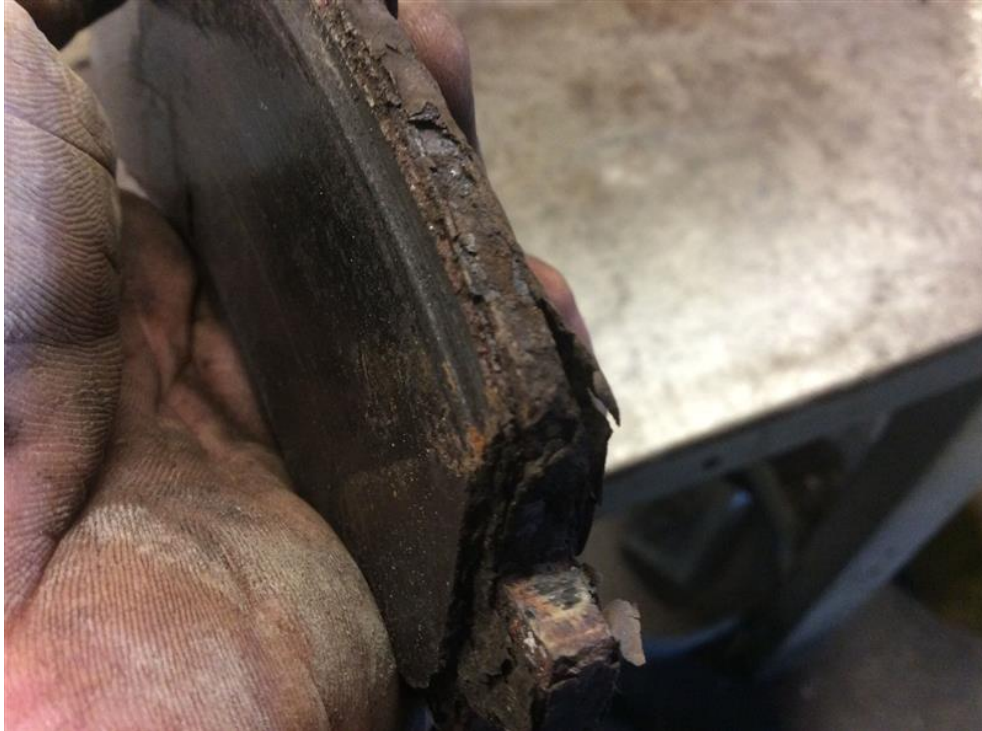
Front Brakes Pads and Rotors