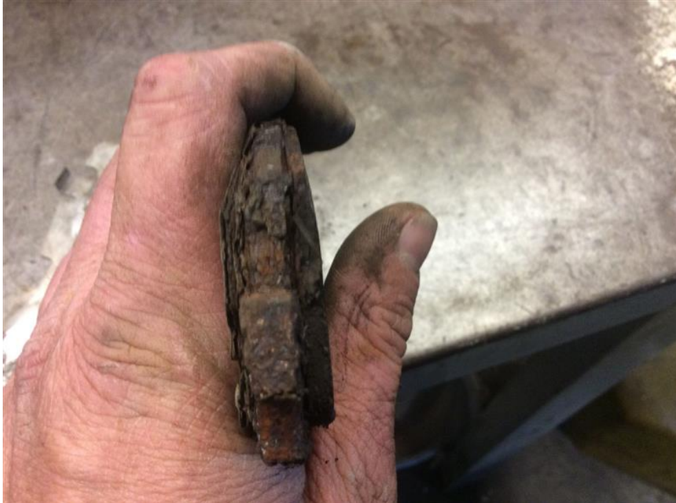
Front Brakes Pads and Rotors