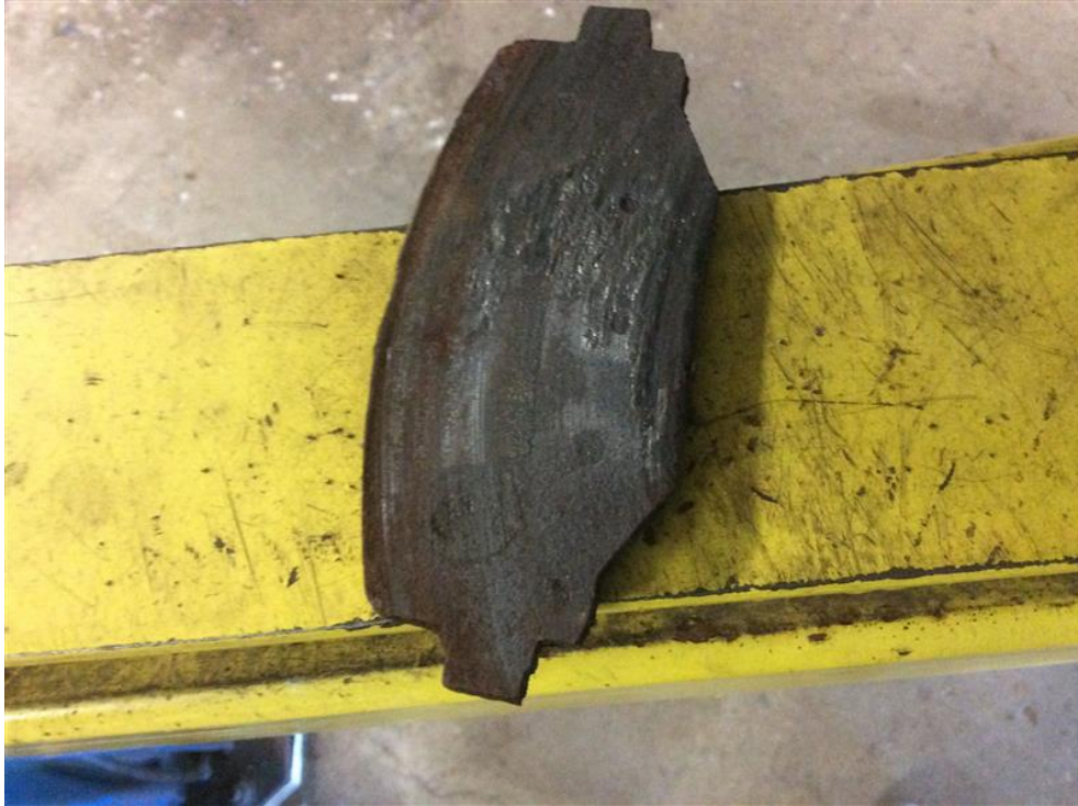
Rear Brakes Pads and Rotors