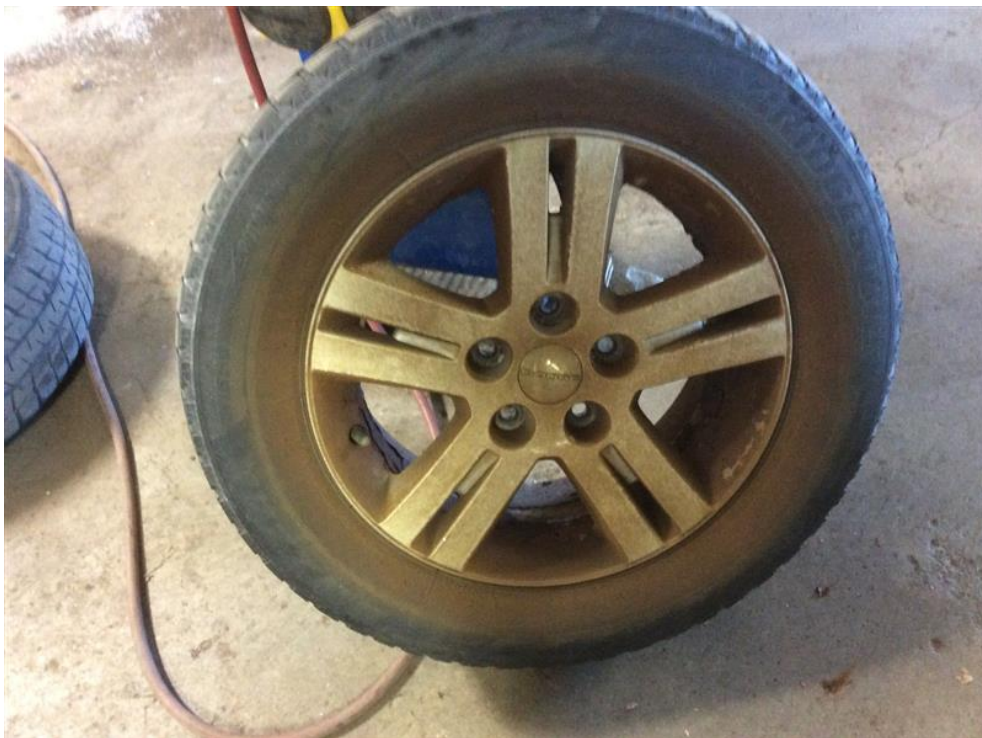
Other/Fluid Leaks/Noises/Steering/Suspension, etc.