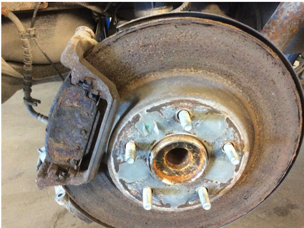
Rear Brakes Pads and Rotors